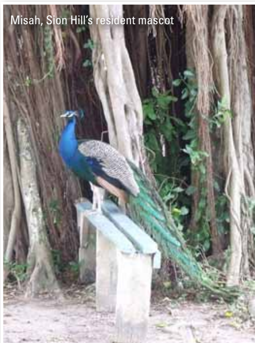
Misah, Sion Hill's resident mascot

This film shoot was a remarkable experience for all of us here at the Virgin Islands/WestCare. It reminded all of us of how special and unique our culture really is. The footage is in the process of being edited and the final product will be on the CHAB website ( http://chab.samhsa.gov/ ) soon.