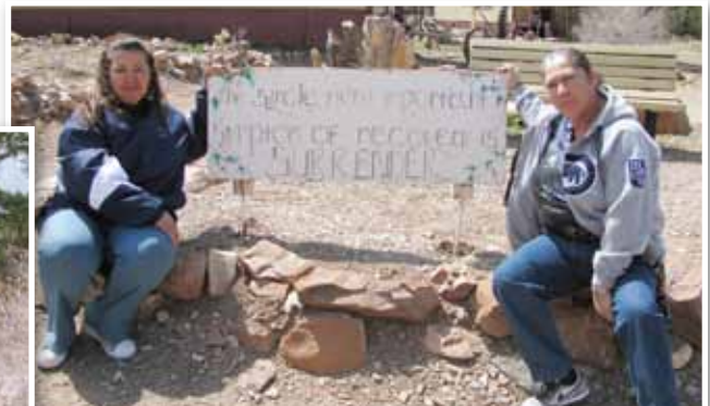
▲ 'Graveyard of the Past,' an old Therapeutic Community tradition

For hundreds of WestCare clients over the years, the path to sobriety began at Harris Springs Ranch. ▼