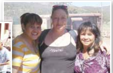
Sisters in sobriety!