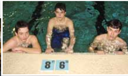
Swimming was a big hit at the YMCA