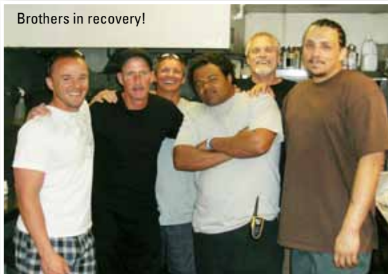
Brothers in recovery!

So as a team we challenge anyone who wants to join to COME GET SOME OF WHAT WE GOT!