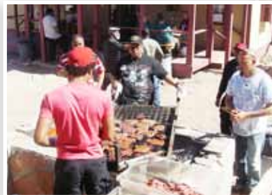
WestCare Nevada alums reunite at Harris Spring Ranch (HSR)