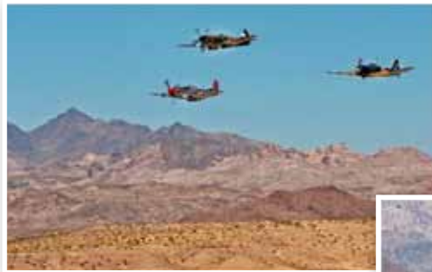
▲ A trio of WWII aircraft soar in formation.

Staff who worked the event enjoyed talking to the many visitors and locals who attended. Meeting so many Veterans from World War Two, Vietnam and the Korean War was an incredible experience. We got to see history walk right before us and the stories were wonderful. There were well over 500 people who visited our table and walked away with information about WestCare and some type of memento with our name and phone number on it. We even had a lady visit our table who is currently working as an intern at the WestCare California Men’s Residential facility in Fresno (It really is a small world).