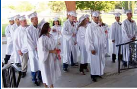
May, 2011 WestCare California graduates nervously wait to make their appearance. ▲