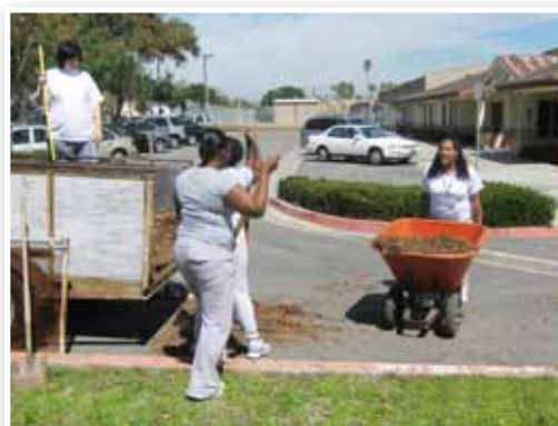
It's hard work, but the clients were excited about the challenge'

The garden, which was dedicated on April 29th, will allow the program to lower their produce costs,