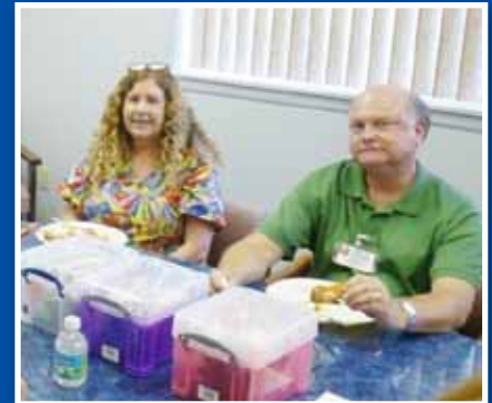
Celebrating Nurses Day in South Florida