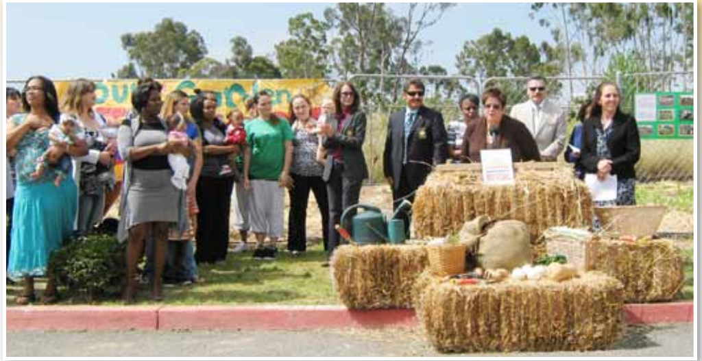
▲ Clients and dignitaries gather for garden dedication.

'The first crop of delicious radishes and two kinds of lettuce!!'