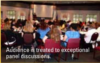
Audience is treated to exceptional panel discussions.