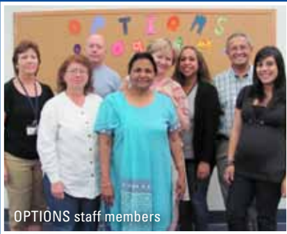
OPTIONS staff members