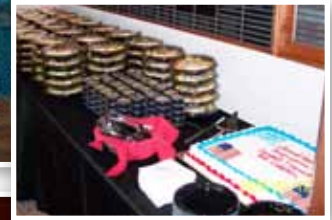
Guest speaker Wajdid Salim (center) former Iraqi Minister of Human Rightsm ▶