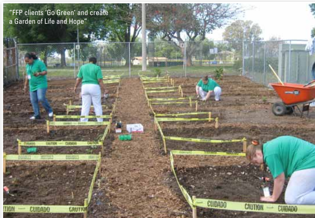
"FFP clients 'Go Green' and create a Garden of Life and Hope"

In addition, the plan is to provide their bounty to other area charities.