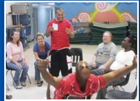
Clients enjoying their team building activities.