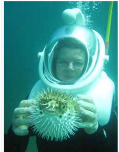
▲ Making friends while exploring during the helmet dive.