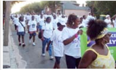
The CARES HIV Prevention and Blanket Atlanta Outpatient Treatment Team's are on the MOVE!